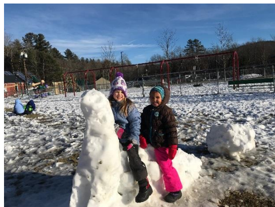
Fun in the snow!

On Friday, January 19 th , we will be having a Community Pot Luck Dinner, followed by Movie Night! Let's share some food, come in your pajamas if you want and make sure to leave room for popcorn. Dinner is at 5:30pm, and the movie starts at 6:15pm. Look for the invitation coming home today with assignments for the pot luck.