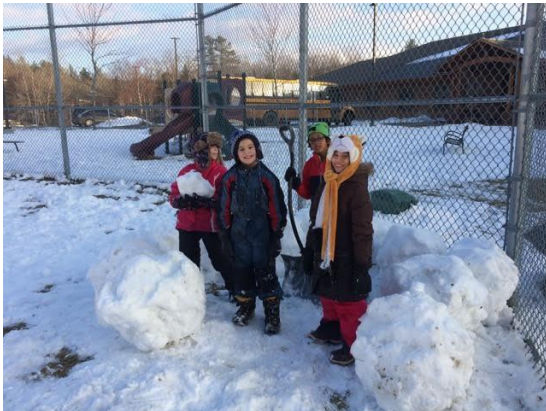
And more fun in the snow!!